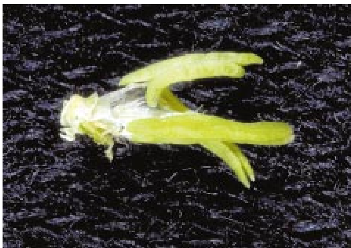
Figure 14: Close-up of twisted anthers and unopened whitish stigma shown in Figure 13.