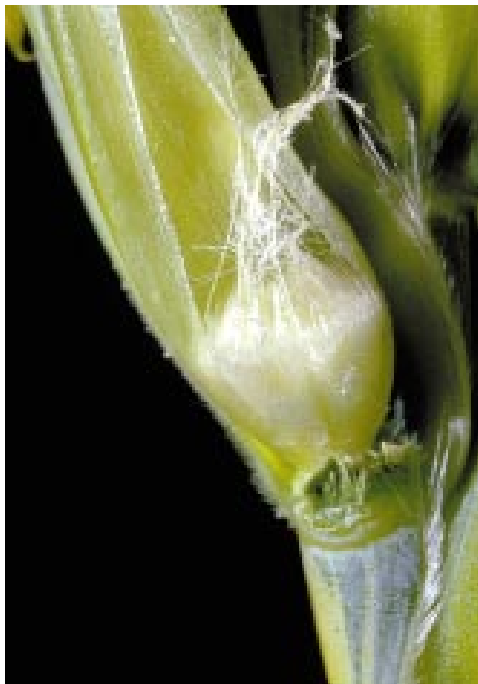
Figure 21: Shortly after pollination healthy kernels begin to develop and are greenish-white.

for several weeks after harvest. The grain should be given a cold treatment before testing, or germination tests should be delayed for about four weeks after harvest. If germination is slow and germination percentage is low four weeks or more after harvest, the wheat should not be used as seed. Shriveled seed should not be used in any case because field emergence is poor even if germination percentage is high. In addition, shriveled seeds produce less vigorous seedlings that usually yield less grain than seedlings from good quality wheat seed.